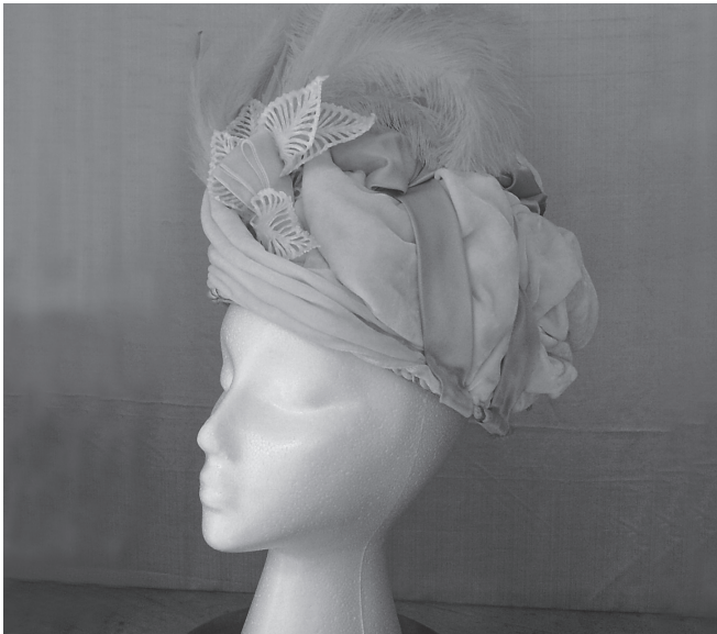
Dolly Madison's inaugural hat

Golden Ball Tavern Museum • 662 Boston Post Road • Weston, MA 02493 http://www.goldenballtavern.org