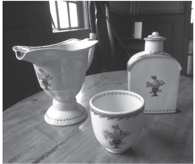
Chinese export ware from GBT collection